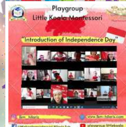
Introduction of Independence Day