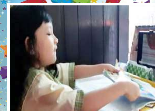
Montessori Area (EPL)