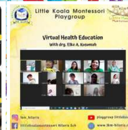
Virtual Health Education