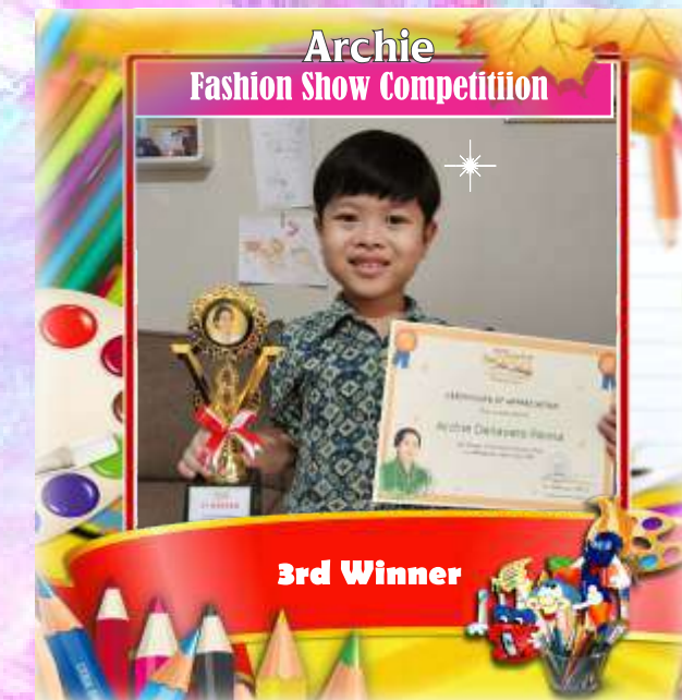
Archie Fashion Show Competition