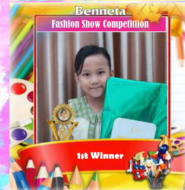
Benneta Fashion Show Competition