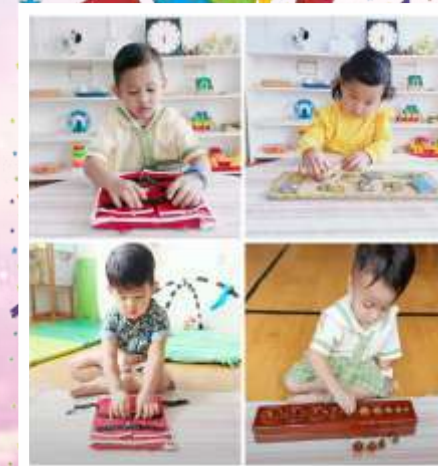
EPL and Sensorial Are