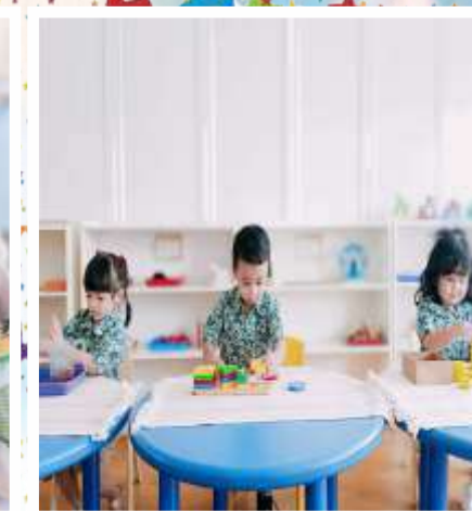
Play Montessori Tools