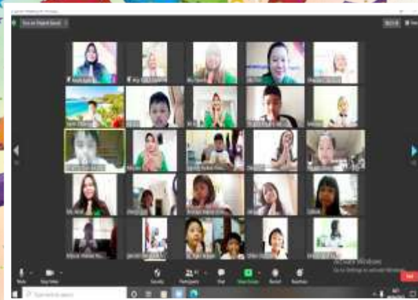
Dental Virtual Visit