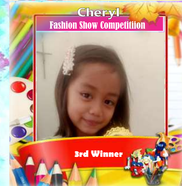
Cheryl Fashion Show Competition