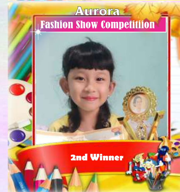
Aurora Fashion Show Competition