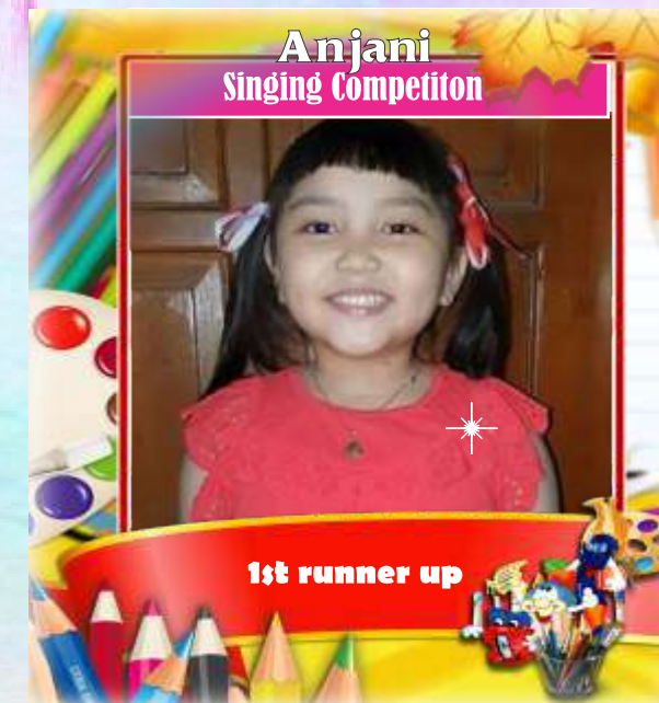
Anjani Singing Competition