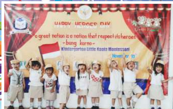
Introduction Hero's Day