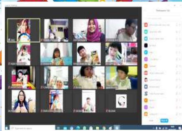
My Parents My Role Model