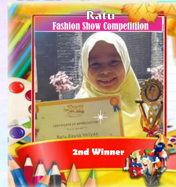
Ratu Fashion Show Competition