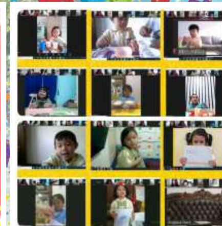
Home Based Learning